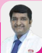
Organizing Committee Chairman

We wish you a happy learning, we are confident that this event will certainly improve our knowledge, skills and approach in perinatal care, most importantly to update our practices ultimately to improve perinatal outcomes.